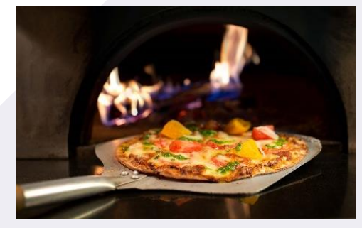
Parrino's Oven Wood-fired pizza & authentic Italian bistro