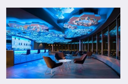
Cloud Nine Cafe Casual dining inside Dallas' Reunion Tower