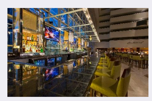
Monduel's Bar Open atrium bar serving craft cocktails & local Texas brews