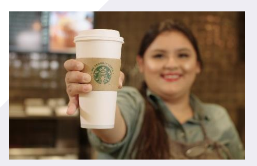
Coffee's Post 24/7 Starbucks that includes ready-made meals